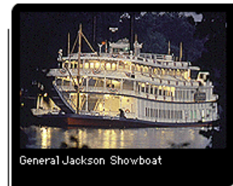
Tennessee Tourism Development

A small group of members has run the past four reunions. By the end of the reunion most of them are ready to go t o bed for a