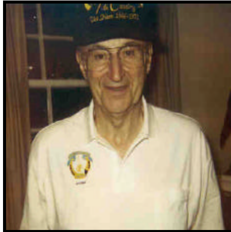
The President with New Shirt!

So here we go. Screen Printed: (will wash well). Small, medium or large are