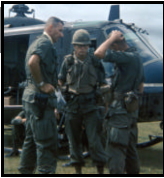
War Paint 6 and War Paint 3, Vietnam 1966