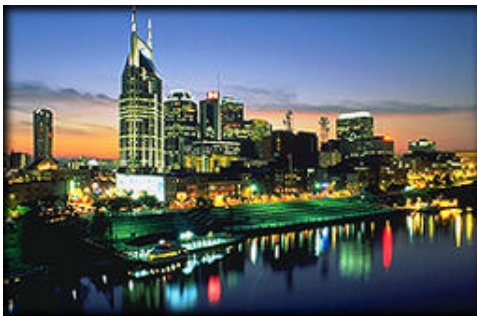
Nashville at Night

Nashville is a super location for a reunion and we know you are going to have a wonderful time. The hotel is very nice with accommodations truly de-