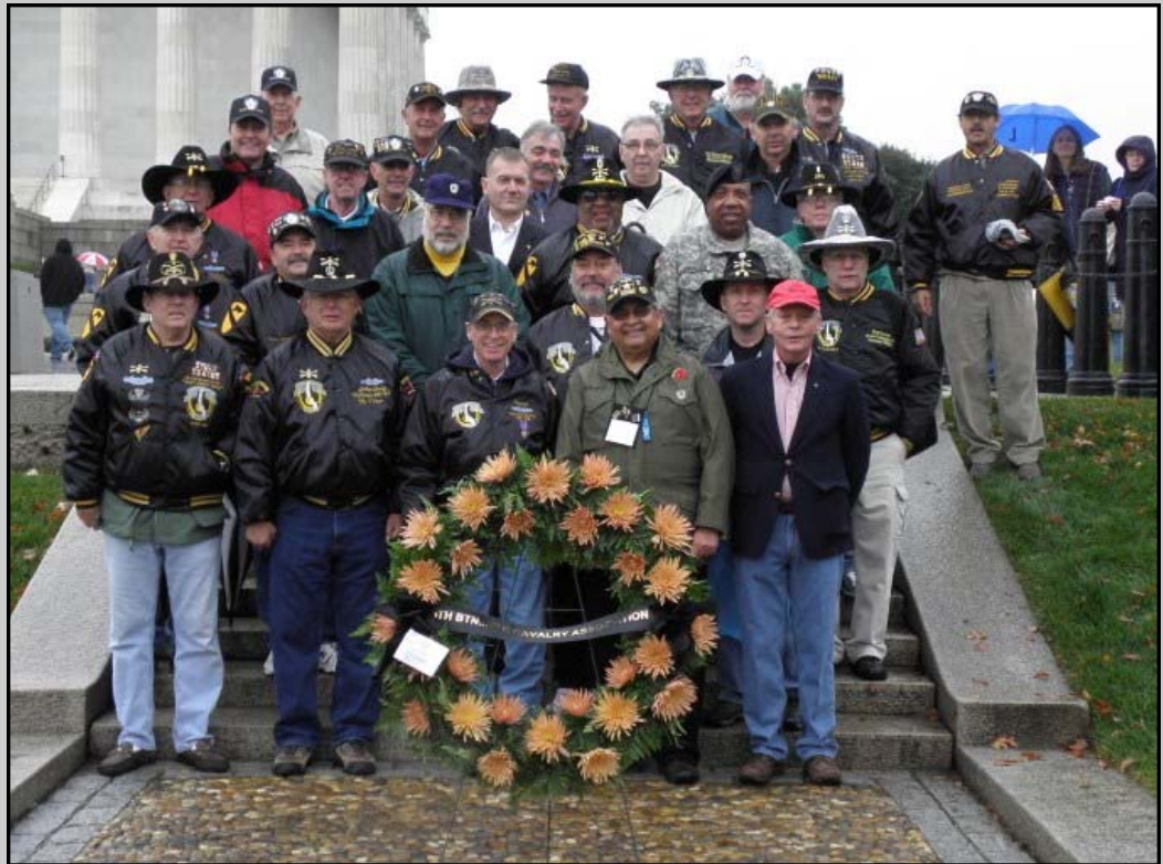
VETERANS DAY, 11/11/2009, Washington, DC