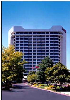
Marriott Nashville Airport Hotel

Reunion X is coming up soon and we're looking forward to a great turnout.