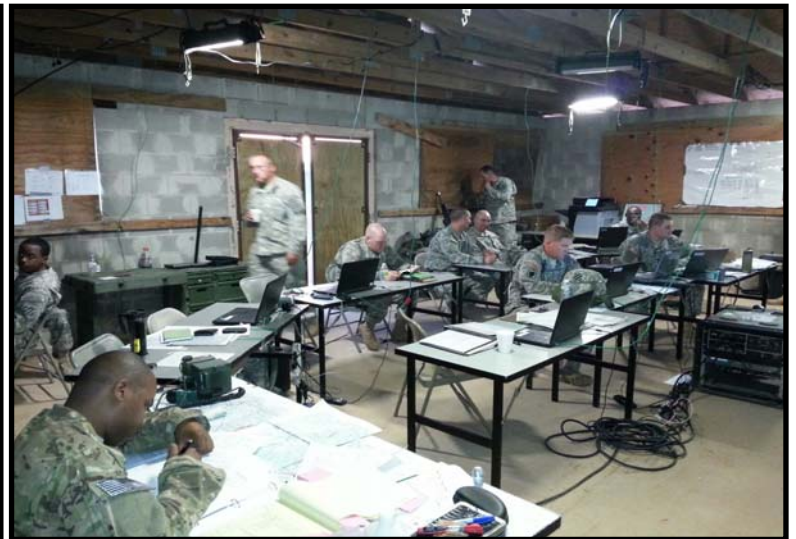
5th Squadron 7th Cavalry Training in the Field in Germany