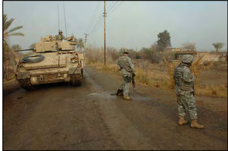
Soldiers from Apache Troop clear the way into Sayafiyah, Iraq

On January 22 we kicked-off offensive operations to clear our new area of insurgents and relieve an enclave of villages that had been fighting against Al Qaeda. For the first time in many months, all three cavalry troops were collocated and operating together. B Troop led the way by occupying and clearing what would become our new patrol base, a massive 500-man capacity facility built entirely by Army Engineers in a farmer's field. While Bandit provided local security, C Troop led the way in clearing the major route into the village of Sayafiyah. Assisted by A Troop, we reached our objective and accomplished all our assigned tasks within two weeks, a full month ahead of schedule! What our troopers were able to accomplish has been truly amazing, and I could not be more proud of our young men and women. We had a few guys get banged-up a bit, but casualties were very light and the mission much more successful than we could have hoped for.