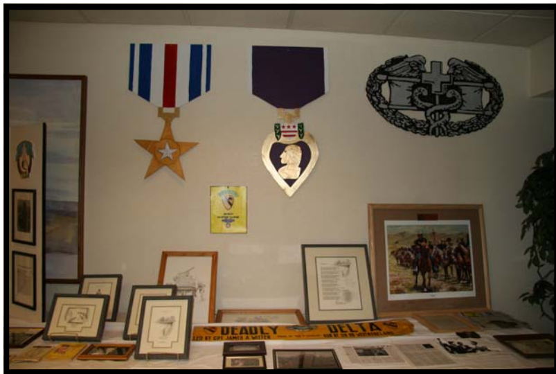
Memorabilia Room, The Academy Hotel, Reunion VIII