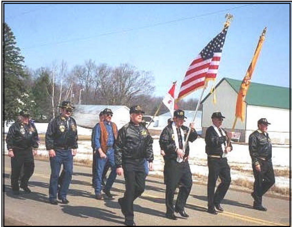
St. Patrick's Day Parade Pickerel, WI