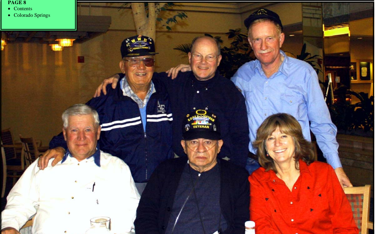
Top Photo: View of The Garden of the Gods and Pikes Peak